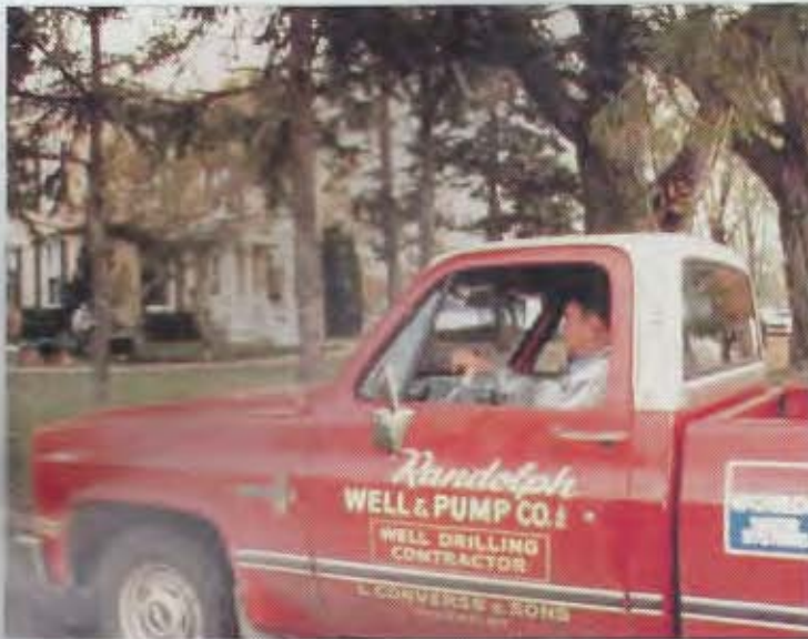
The typical family home needs over 300 gallons of water a day per person, just for drinking, cooking, and cleaning.