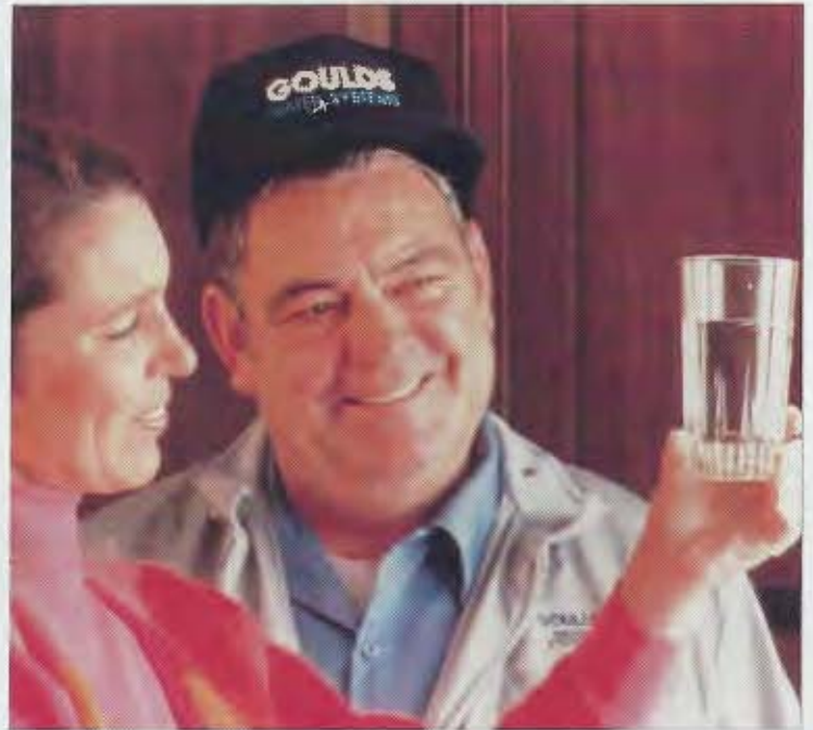
Water treatment may offer the biggest opportunity for Goulds Dealers since they got their first Goulds submersible pump. The home water treatment market is more than $600 million a year.