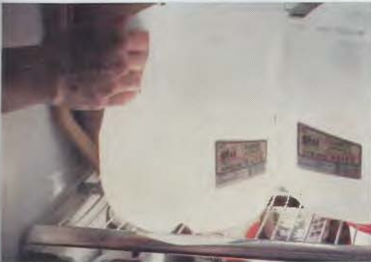
People are increasingly concerned about the quality of water. That's why over two billion gallons of bottled water were consumed in America and Canada last year.