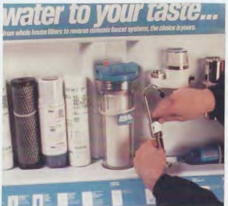
Dealers can sell and install AquuGuard Filters with various type cartridges to serve specific purposes, such as carbon to solve taste and odor problems, and sediment filters. Models include faucet mounted, in-line, and whole house or under sink systems.