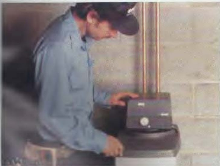
That's why Goulds has moved into the water treatment business. Goulds dealers can now satisfy the need for quality water... from the bottom of the well to the bottom of the glass.